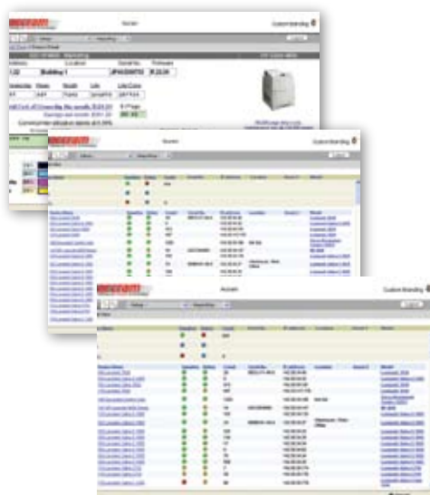
Print Fleet Manager Plus